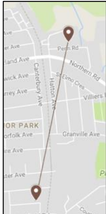
Penn Wood Primary and Godolphin Infant