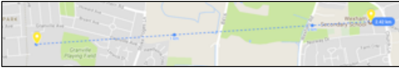
Baylis Court School and Wexham School