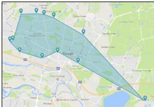
Baylis Court School, Beechwood School, Ditton Park Academy, Herschel Grammar School, Langley Grammar School, Langley Academy, Lynch Hill Enterprise Academy, Slough and Eton CE Business & Enterprise College, St Bernard's Grammar School, St Joseph's RC High School, Upton Court Grammar School, The Westgate School, Wexham School